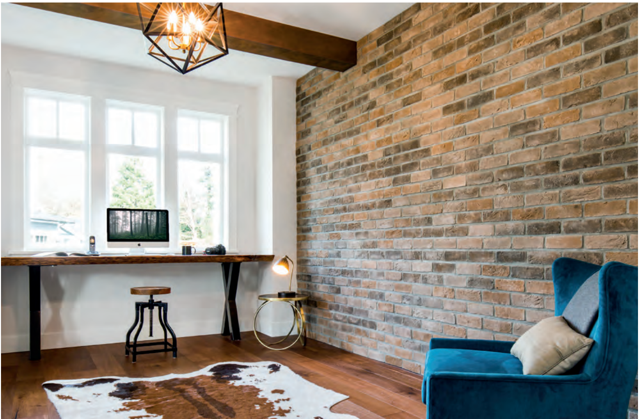
Cultured Stone Handmade Brick in Moroccan Sand

Driven by a pioneering spirit, Cultured Stone introduced the world's first architectural stone veneer, making it possible to feature authentic hues and natural textures of stone and brick in any environment. Nearly 60 years later, Cultured Stone continues to lead the industry by creating the finest stone products for empowering the artist within and bringing incomparable designs to reality.