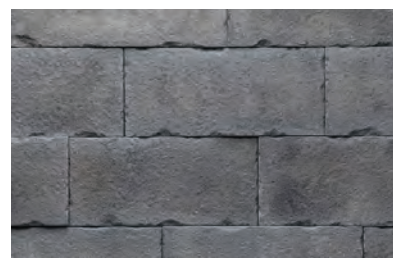
Carved Block Style