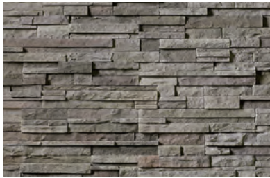
Pro-Fit® Alpine LedgeStone