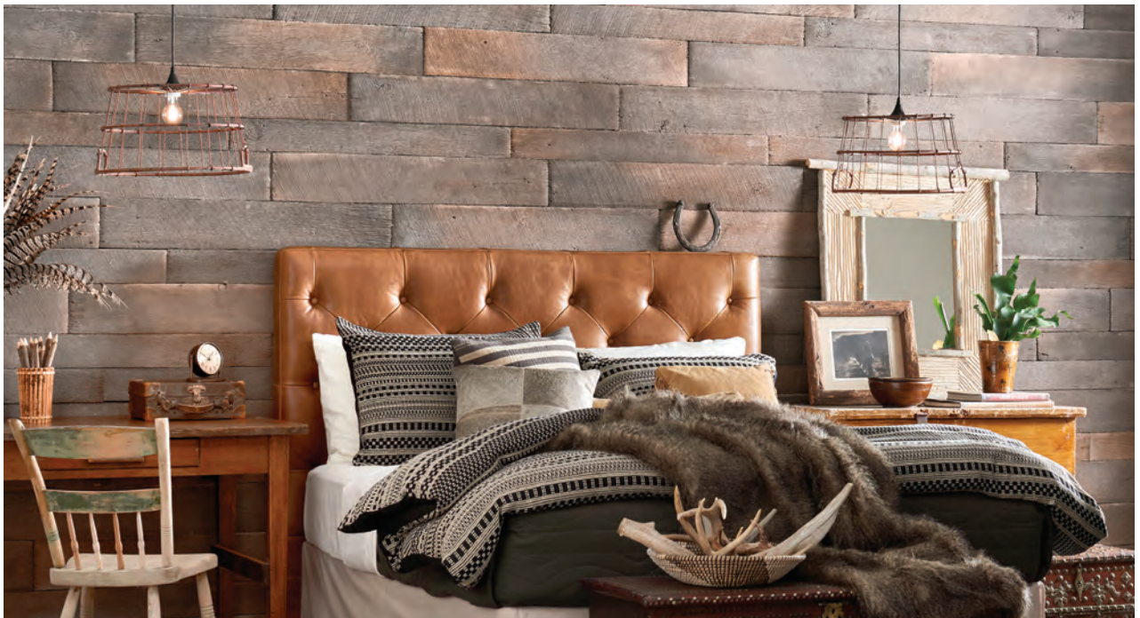
Dutch Quality Stone Weathered Plank 4 & 6 in Winesburg

Otherwise, it just wouldn't be Dutch Quality Stone.