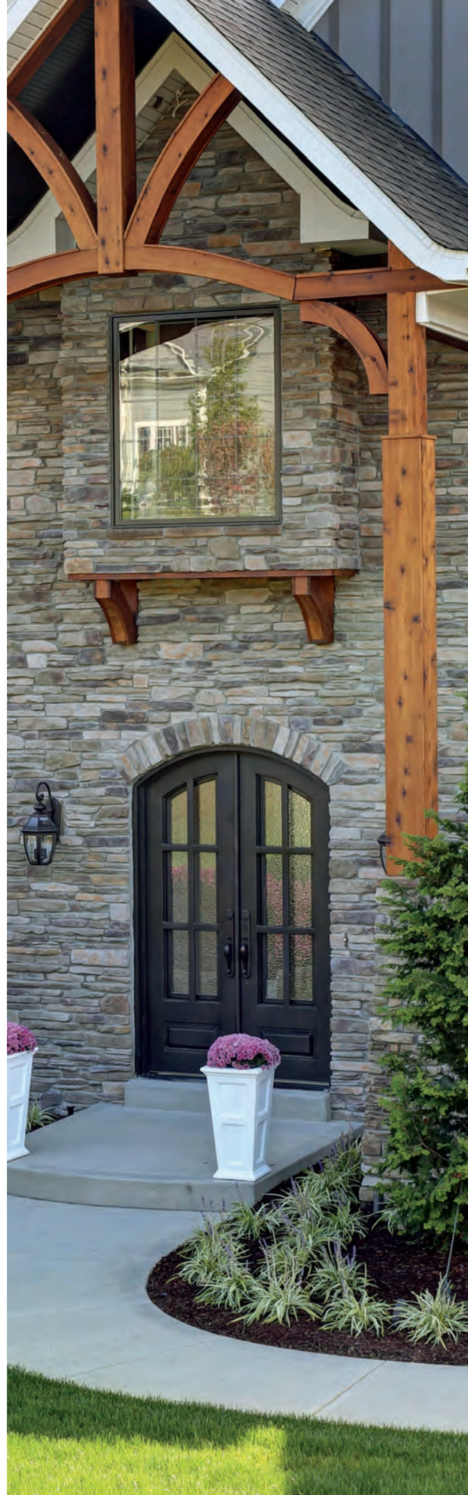
Cultured Stone Southern LedgeStone in Bucks County