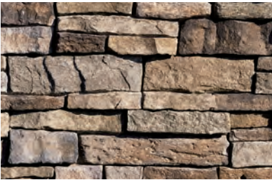
Mountain Ledge Panels