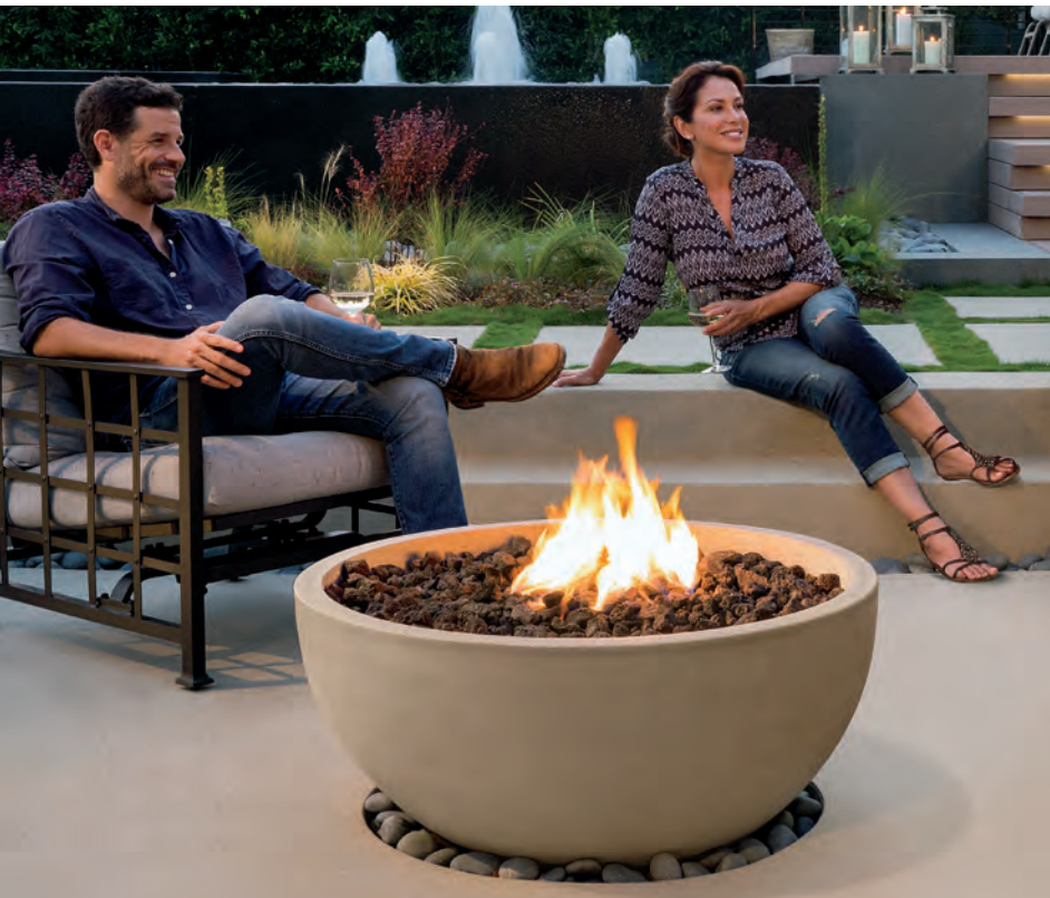
Infinite® Fire Bowl in Oyster Shell with a Honed Finish

Distinguished by craftsmanship, accentuated by firelight and designed to gather round, Kindred Outdoors & Surrounds creates memorable spaces that bring people together through thoughtful composition and functionality. With hand-forged fire bowls, fireplace surrounds and outdoor kitchens, friends and family can commune, converse, and unwind in comfort both inside and outside of the home.