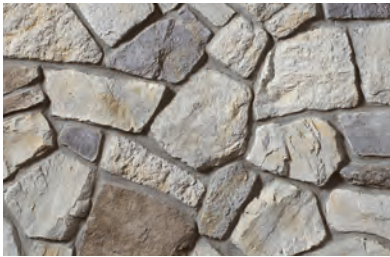
Old Country Fieldstone