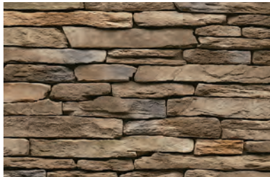
Lauren Cavern Ledge