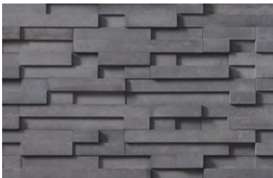
Pro-Fit® Modera LedgeStone