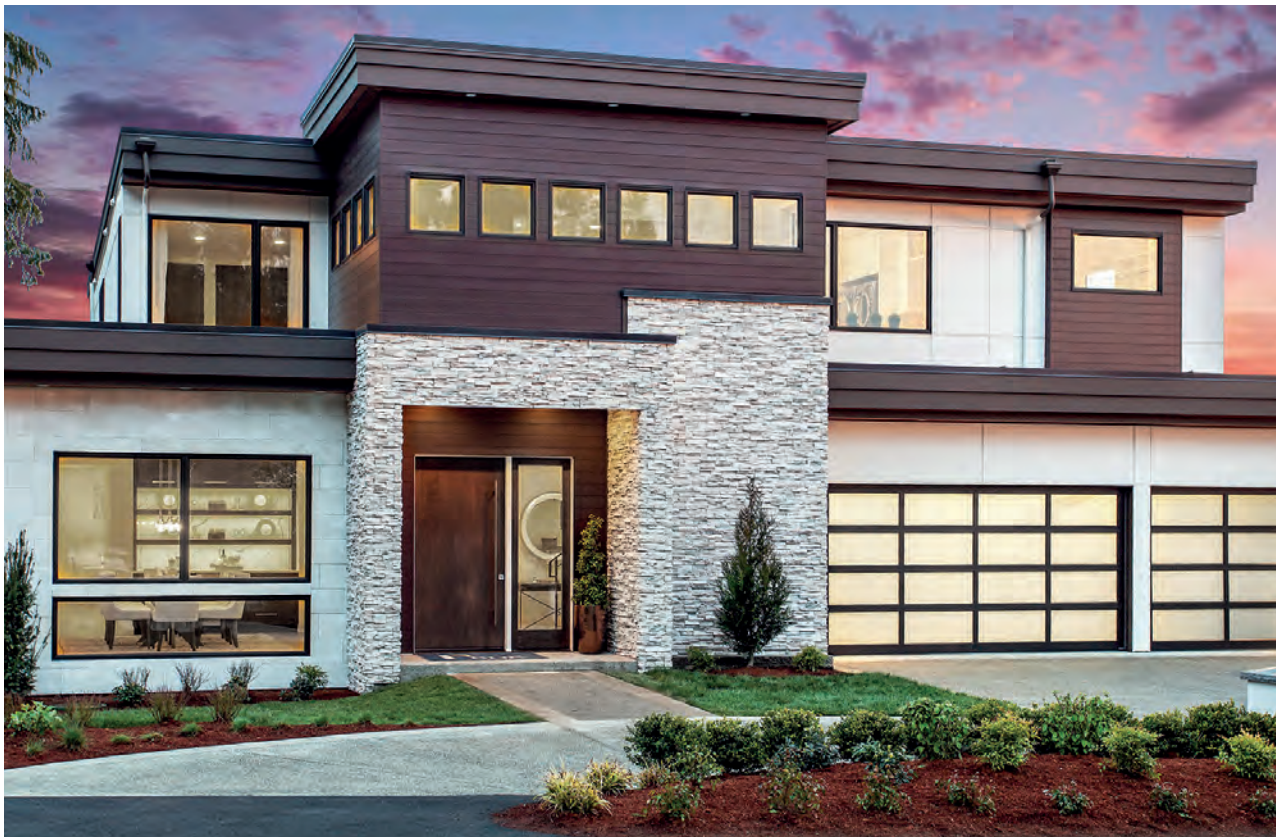
Eldorado Stone Marquee24 in Dove Tail and Stacked Stone in Daybreak

For more than 50 years, Eldorado Stone has pushed the boundaries of possibilities; harnessing nature's power and creativity to design a collection of premium architectural stone and brick veneer profiles. Handcrafted with artistic colors and expressive textures that verge from traditional to contemporary, Eldorado Stone products offer the ideal backdrop for curating indoor and outdoor spaces that lead to a lifetime of new moments to enjoy.