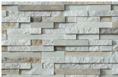
Pro-Fit® Terrain™ LedgeStone