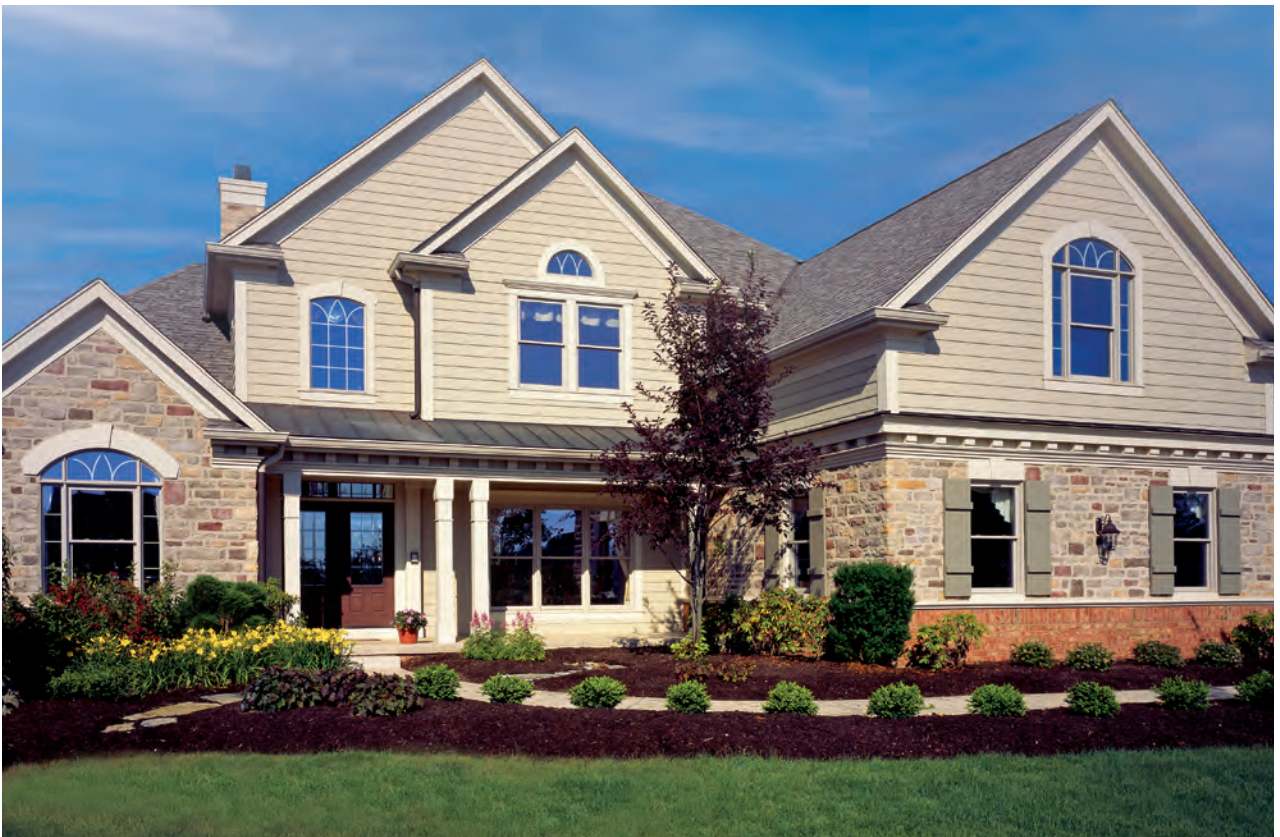
StoneCraft Heritage in Chardonny

Our commitment to craftsmanship can be seen within every textural detail, countless hours spent hand-chiseling each and every natural stone before it was carefully replicated through our proprietary mold techniques. At StoneCraft we honor the masonry traditions of the past and promise to deliver quality and affordability with every stone we make.