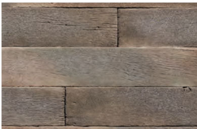
Weathered Plank 6