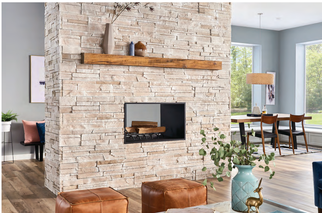
Versetta Stone Ledgestone Style in Sand