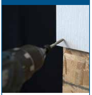
AZEK Trim won't split near edges. Fasten within 2" from edge.