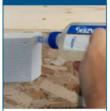
Use AZEK Adhesive at trim joints to minimize gaps from expansion and contraction.