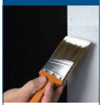
When painting AZEK Trim, select the right paint to ensure the best long-term performance.

AZEK Trim and AZEK Mouldings should be installed using the same good building principles used to install wood trim and mouldings. Always follow the local building codes and AZEK's complete installation guidelines that can be found at www.azekexteriors.com.