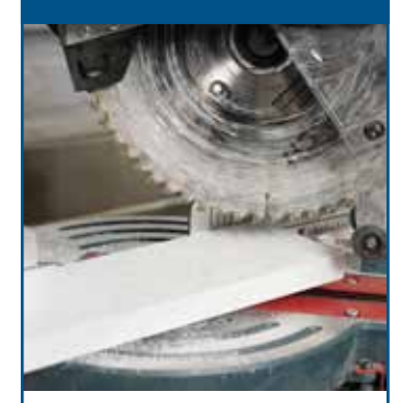
Normal wood working tools may be used to install AZEK Trim and Moulding.